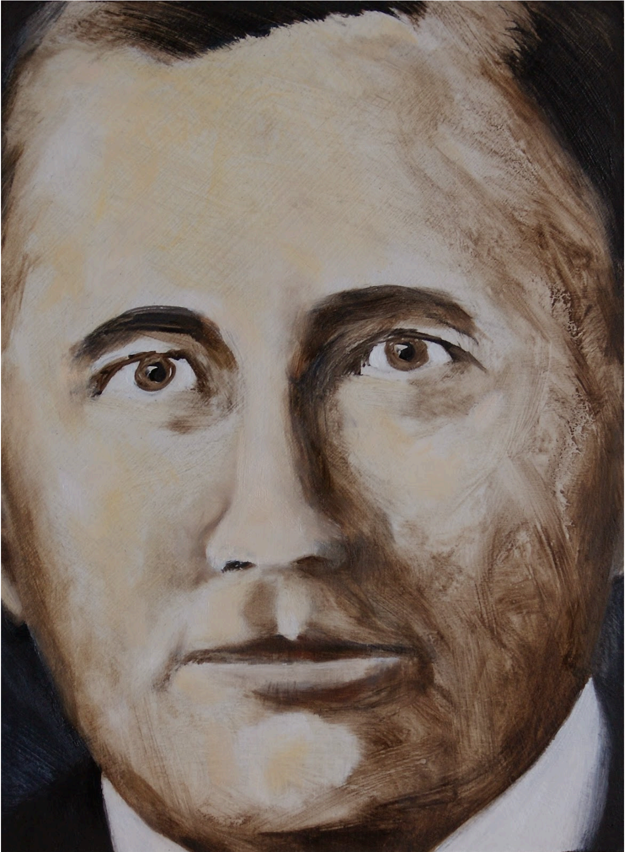
The Doctor 13 x 17.5 cms