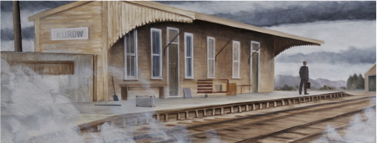
Leaving for the conference 52 x 20 cms

The doctors house still exists in Kurow. It was here the three would meet, discuss and write their vision for their New Society.