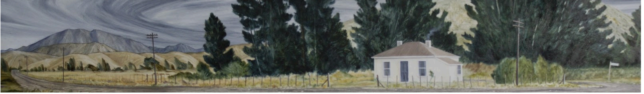
The Doctors House. 107 x 16 cms

The doctors house still exists in Kurow. It was here the three would meet, discuss and write their vision for their New Society.