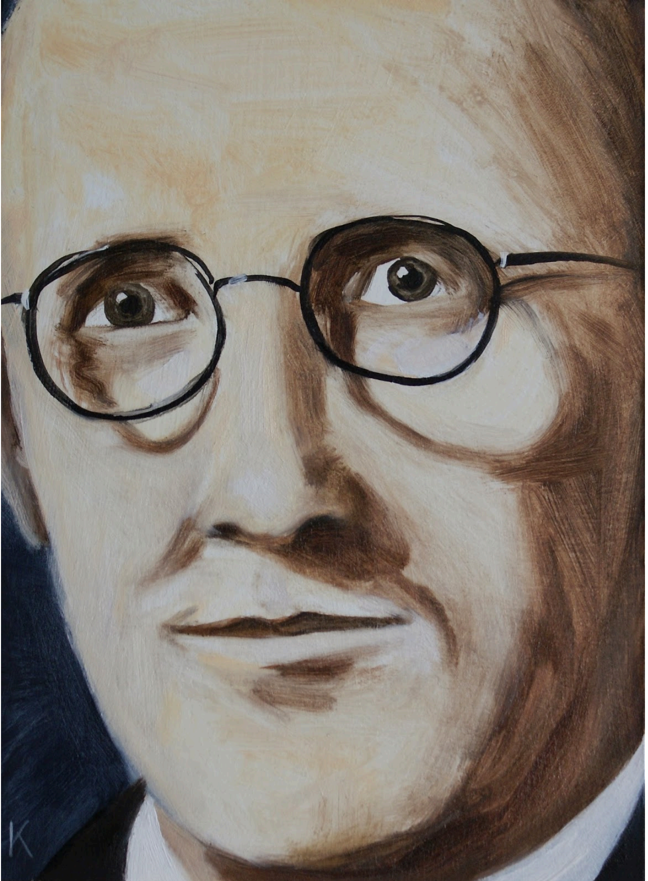
the Minister 13 x 17.5 cms

At the Willows and At the Doctors kitchen Table - three watercolors.