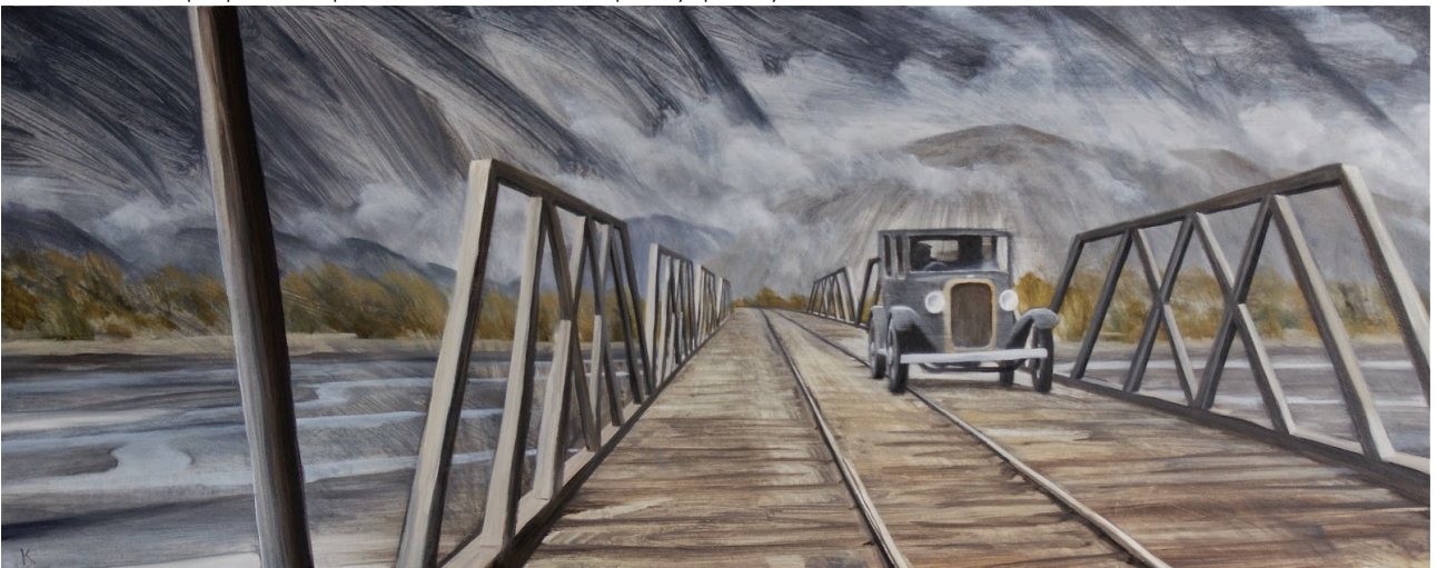
The trains would make way 36x 25 cms