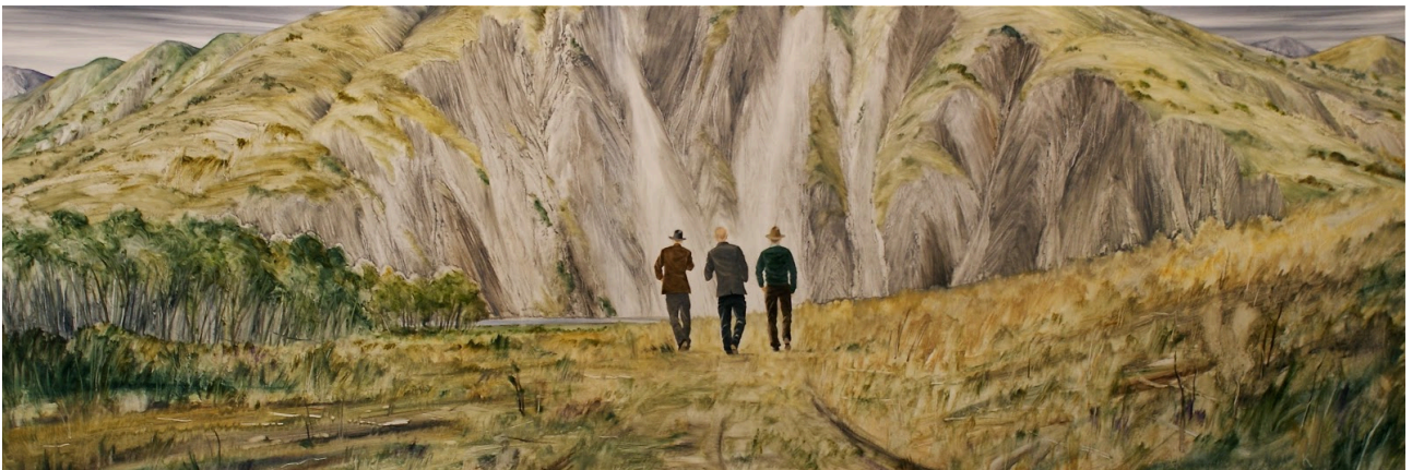
To Create a New Society. 120 x 40 cms