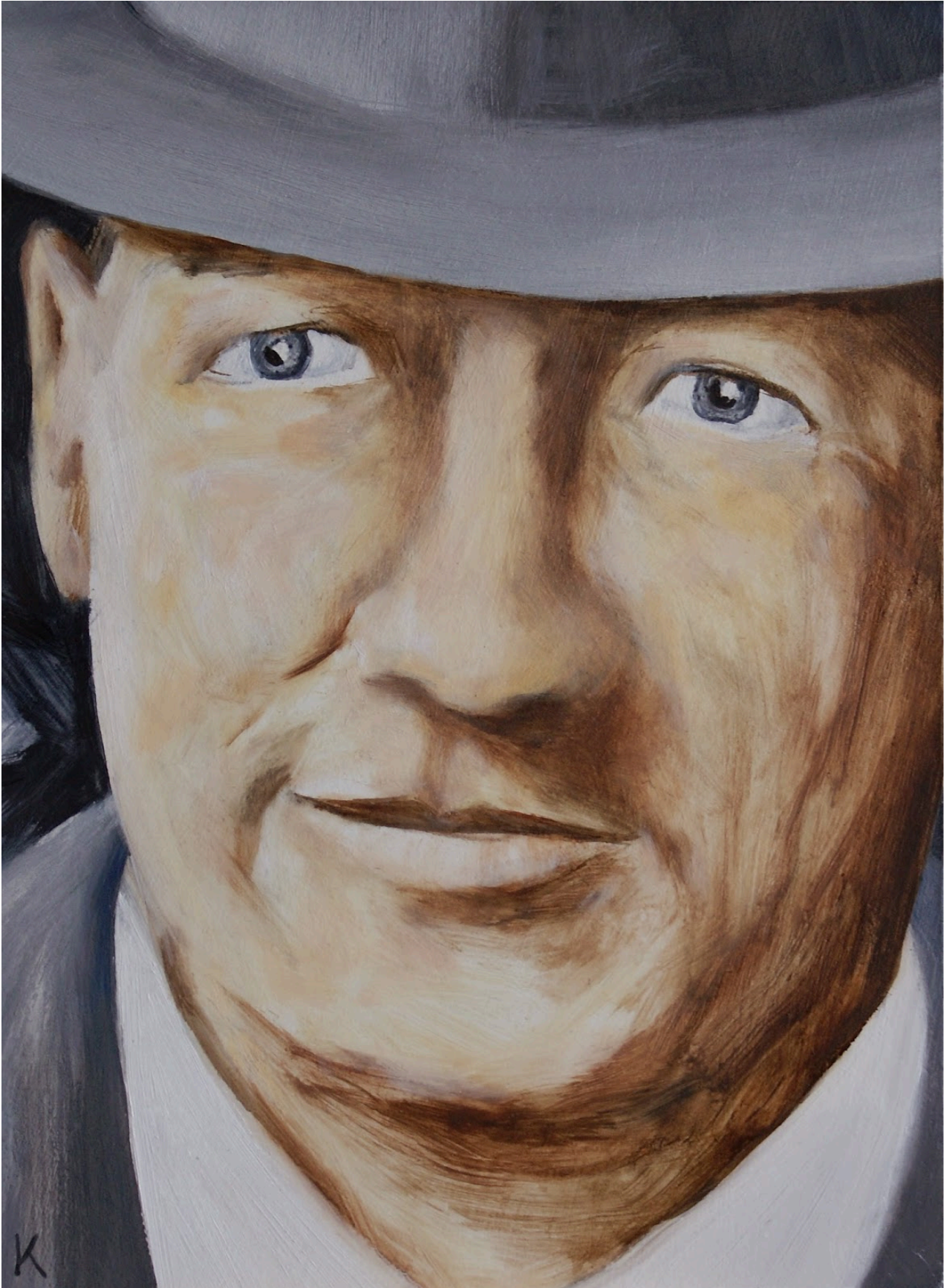
The teacher 13 x 17.5 cms